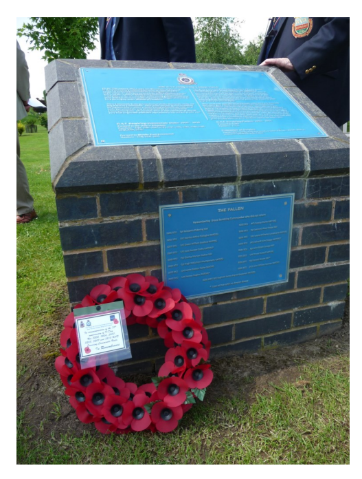
The RAF Servicing Commando Plinth