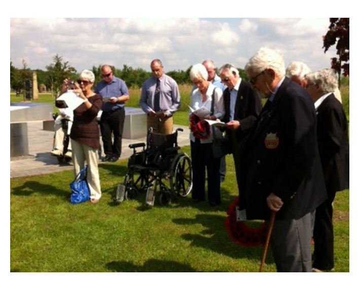
We Will Remember Them