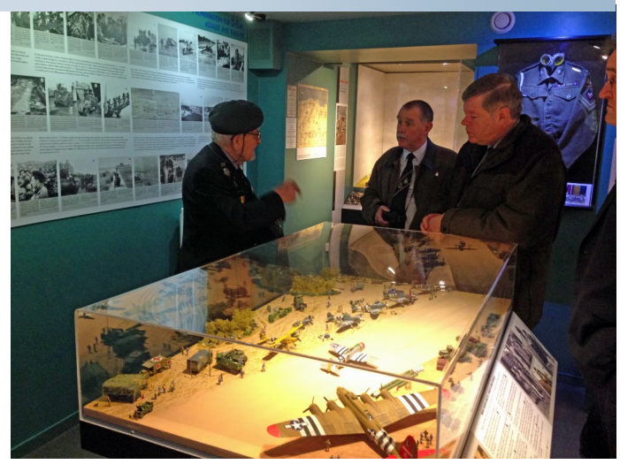
The Gold Beach Museum at Ver sur Mer

It was at St Croix sur Mer that we enjoyed the most poignant moments of the trip