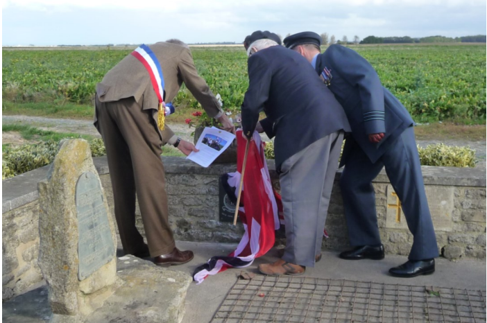
The B3 Airfield Memorial at St Croix sur Mer