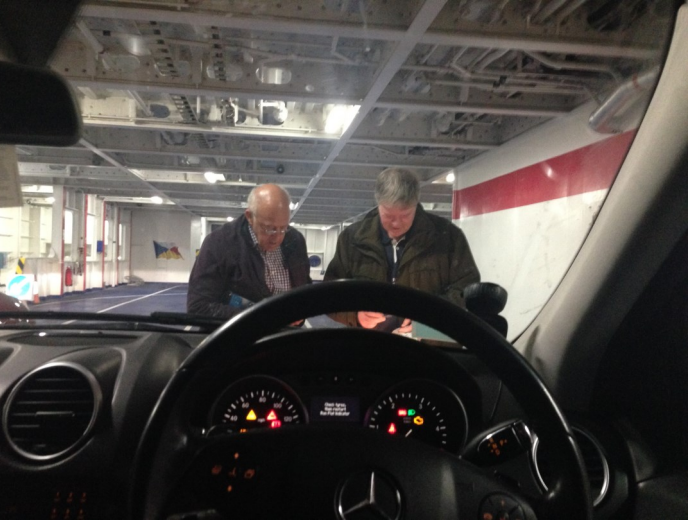
The headlight adaptor party get to work