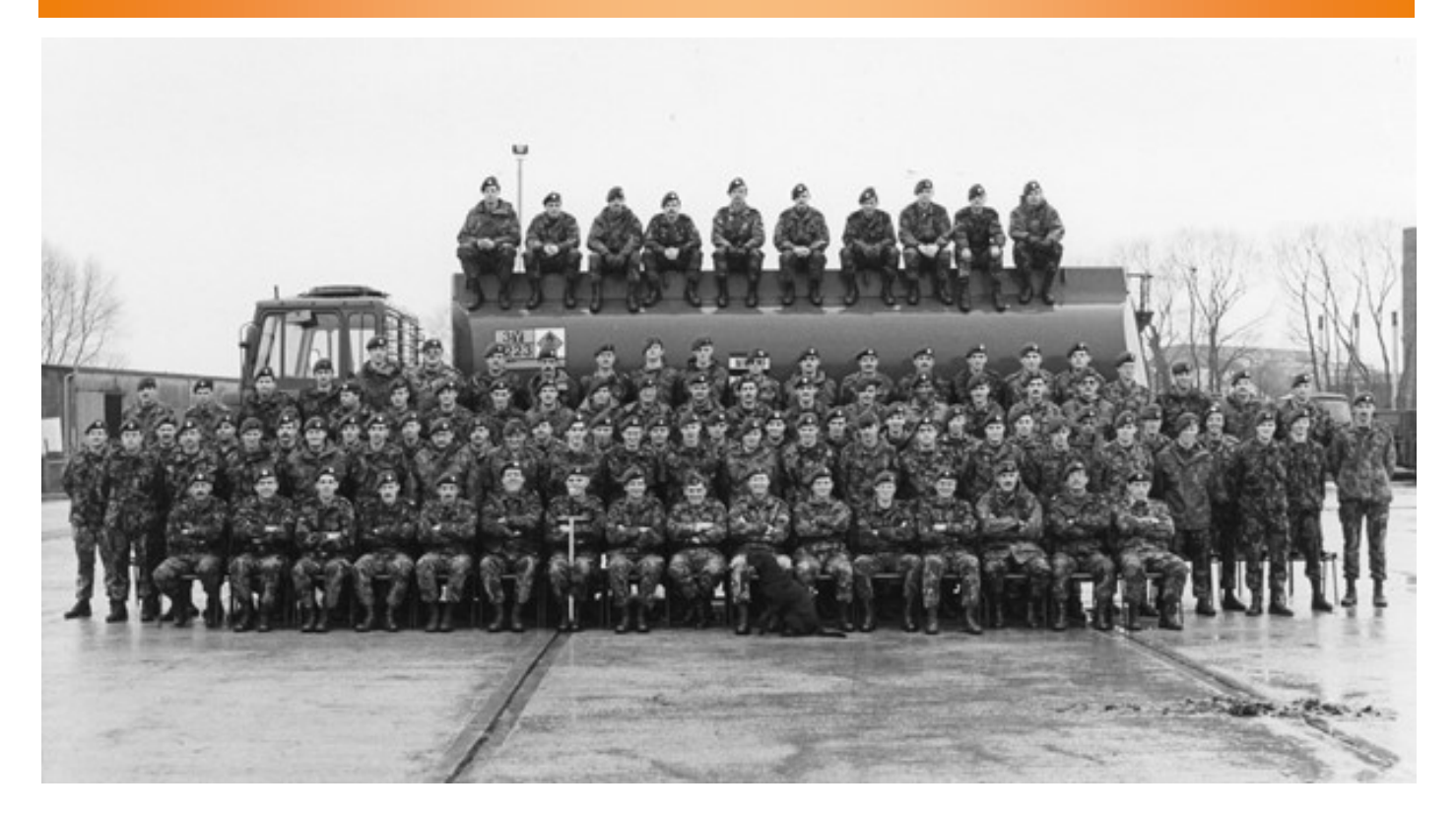
Tactical Supply Wing 1987