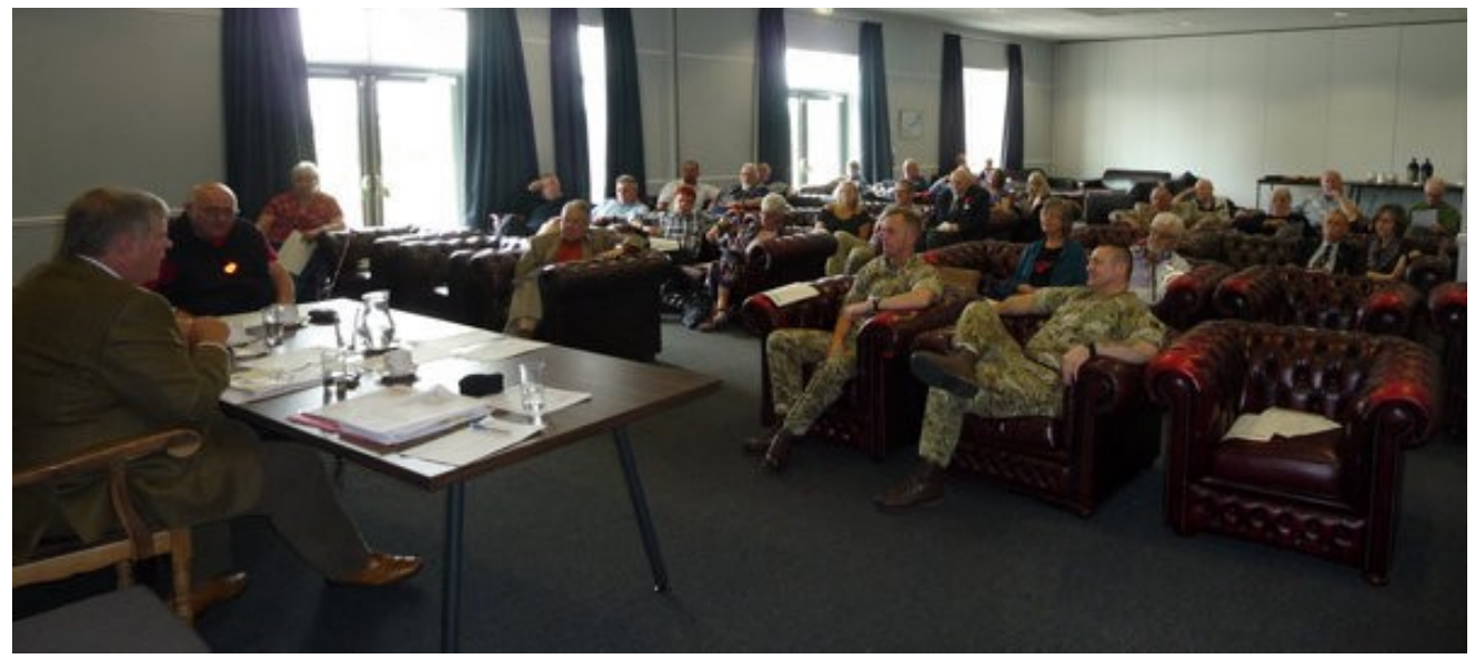
The 2017 Annual General Meeting

Their bravery, endeavour and achievements will not be forgotten and will forever be an inspiration to those who provide expeditionary logistic support to the Royal Air Force.