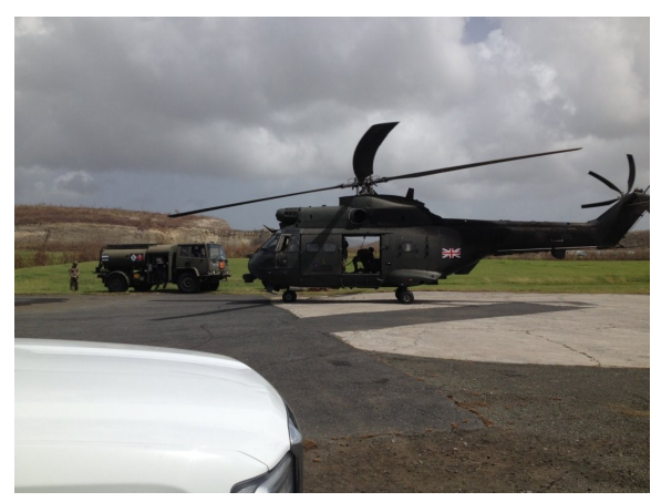
The mighty Tac B was commissioned...

The remaining personnel at USVI supported the Puma Force and had the opportunity to conduct some under-slung loads which consisted of netted loads filled with water. Due to Hurricane Maria, the US ramped up its relief efforts and several thousand US forces personnel arrived in theatre. With little in the way of accommodation for the troops, the US dealt with this in their own stylish way, they provided a cruise liner. Due to the assistance JHF3 had provided to the local population and around the airport we found ourselves being provided enough cabins to house most the Det.