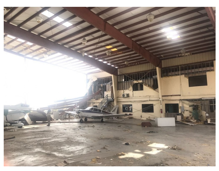
The aftermath of Hurricane Maria