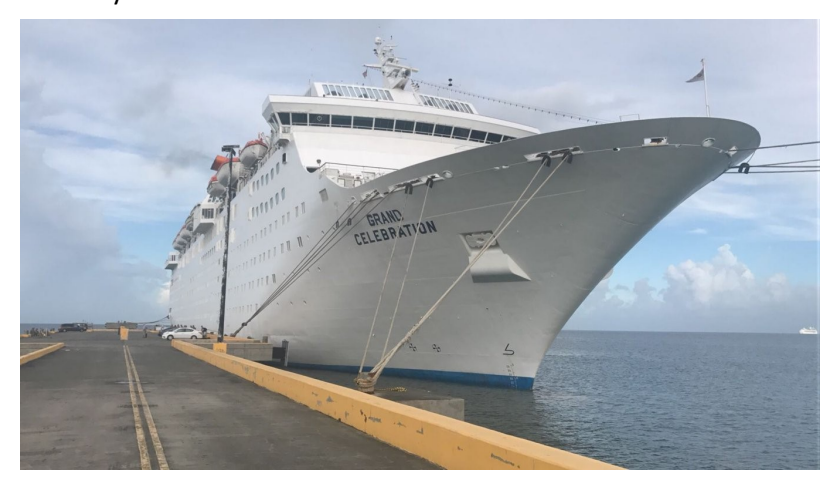
...they provided a cruise liner.

As civilian contractors became more established the Military effort was ending. By the 7 Oct all fuels equipment had been packed up ready for return to the UK. All TSW personnel from USVI departed for the final time and headed back to Barbados before arriving at RAF Brize Norton in the early hours of the 9 Oct 17. Those personnel at Turks and Caicos Islands followed 2 days later and arrived home on the 11 Oct 17.