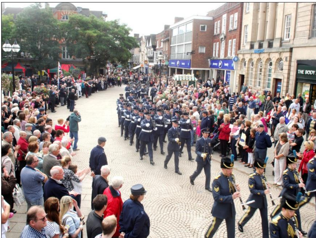
TSW personnel exercise their privilege to parade in the Borough of Stafford

On the 18th September 2010 Airmen and Soldiers from MOD Stafford marched through the town centre, bayonets fixed and swords drawn exercising their privileges to the freedom of the borough. The parade was followed by a service at the Collegiate Church of St Mary, to honour and commemorate the brave who fought and died during the Battle of Britain.