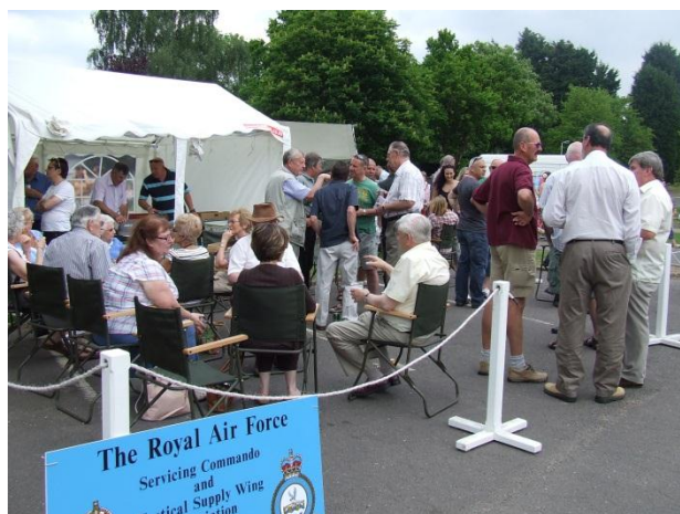
The Association "marquee" with complimentary drinks for members!