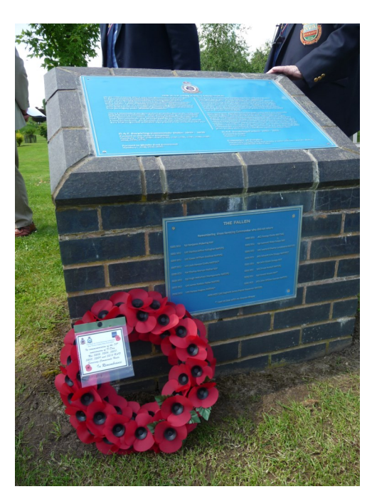
The RAF Servicing Commando Plinth